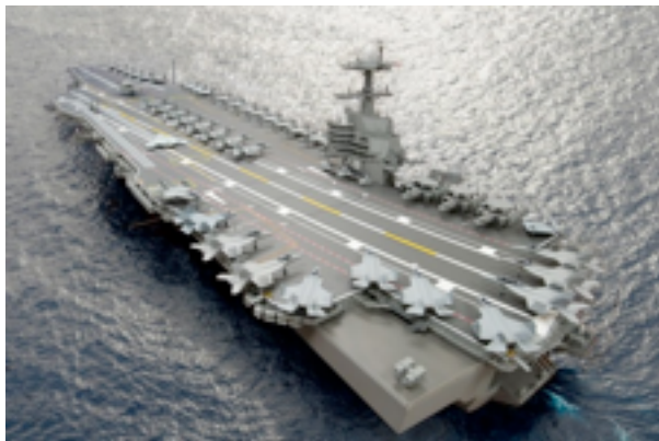
Ford class carrier John F. Kennedy (CVN-79)