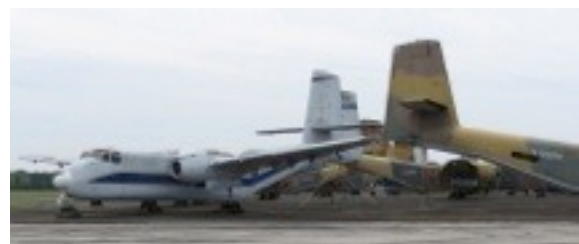
The answer to last month's quiz question is that these aircraft are DeHavilland Caribou DGC-4's. They were used by the Spanish Air Force and are now in Cape May NJ.

This may be my last chance at a written appeal for you to get out and shake the bushes for those last Lightspeed award votes. Please do your best. An eleventh hour surge could put us in the running. The voting has been extended to November, so please make sure your vote and all your friends and family votes are counted. Thanks for the help. CAVU!